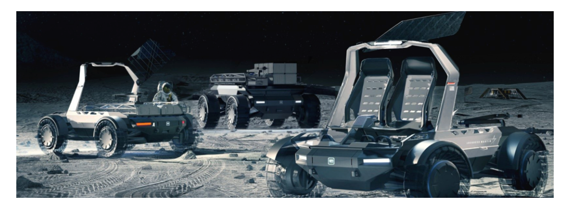
Figure 1. The Lockheed Martin Lunar Mobility Vehicle (LMV) enables unprecedented exploration of the Moon with autonomous, telerobotic, and manual operation. <sup>1</sup>

The MILO Space Science Institute (MILO) actively seeks collaborations with international partners based on their unique capabilities and mutual scientific goals to participate in a Lunar science rideshare mission, Luna Ride . MILO will work with respondents who are interested in deploying payloads to the surface of the Moon on the Lockheed Martin Lunar Mobility Vehicle (LMV; Figure 1).<sup>1</sup> The Luna Ride mission will include transportation, communication, support for survivability, and deployment of payloads onto the lunar surface. We seek responses and indications of interest from nations or organizations with mature space flight heritage as well as from those with relatively new, and perhaps growing, space agencies and/or ecosystems. The MILO Project Office supports mission concept design and operations, identification of science objectives, and access to test facilities and subject matter experts with deep space mission experience to minimize risk. Luna Ride offers respondents the opportunity to advance lunar surface science, demonstrate science-focused engineering capability, and grow regional space capacity through access to hands-on instrument development, test, and operations.